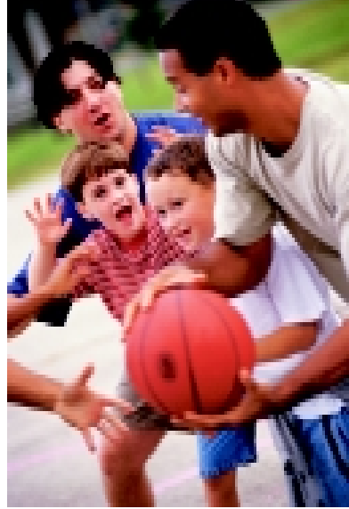
The right kind of activity can be invaluable to help redirect a child's energy, tap into hidden talents or interests and develop social skills.