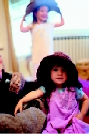
Seventy-two percent of parents of children with AD/HD report that their child has trouble getting along with siblings or other family members.